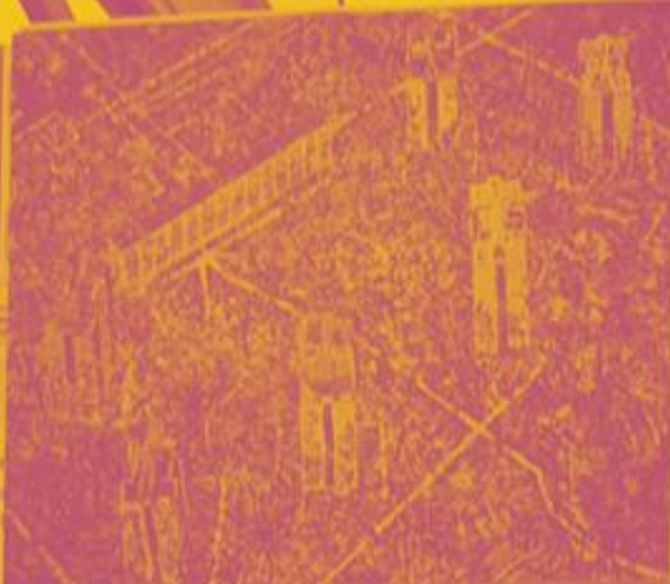
Image: Sarah Savage, 'Teer: Suburban Village' 'London Estate', Acrylic on Canvas, Original, 102 x 112 cm (Unframed), £1,200